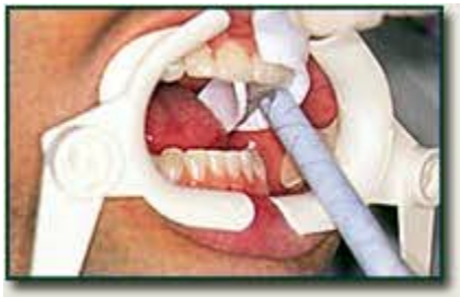
Figure 3. Triple Tray loaded with 30-Second Blue Velvet is inserted on the posterior maxillary quadrant. The mandibular side of the tray is then loaded.

This is a two-step impression technique relying on the generation of hydraulic pressure to propel impression material into the sulcus and all the internal aspects of the preparations. In the first step, 30-Second Blue Velvet was loaded onto one side of the Triple Tray, which was inserted on the maxillary posterior quadrant. The other side was loaded with the bite registration material (Figure 3). The patient was instructed to close all the way down into MI and hold the position until the material had set.