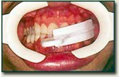
Figure 2. Empty Triple Tray being tried in to check fit.

this time, the dentinal tubules were sealed and the patient felt no discomfort when the anesthesia wore off. When the patient returned for the insertion of the prosthesis, it was not necessary to administer local anesthesia because the dentinal tubules were sealed. As a result, the patient was spared the discomfort of having a second inferior alveolar block. Because of the extent of the carious enamel and dentin, the finish lines of the preparations were extended down to the gingiva. To make an accurate final impression clearly reproducing the finish lines, a quadrant Triple Tray was used (Premier) with the hydraulic and hydrophobic impression technique 2 (Figure 2). This technique was selected because it allowed accurate reproduction of the finish lines without having to pack retraction cord. A flexible cheek retractor to increase access was also placed.