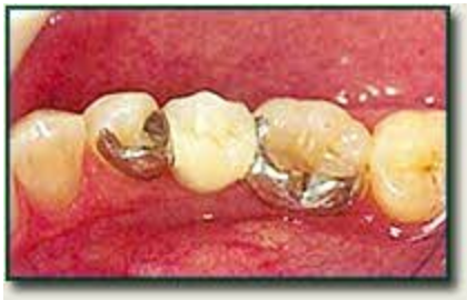
Figure 1. Lingual view of the failing 14-year-old Maryland bridge replacing a missing mandibular second premolar.

A 35-year-old male presented with a failing Maryland bridge replacing a missing mandibular second premolar (Figure 1). There was carious enamel along the margins of the metal wings on the first premolar and first molar. Because of the extent of the carious enamel, the patient was advised to have the Maryland bridge removed, allowing the full extent of the caries to be identified and excavated. The Maryland bridge had debonded and been recemented once before during its 14 years. Neither metal wing was loose. The patient was also dissatisfied with the extent to which the metal wings were visible and wanted them replaced with a more aesthetic prosthesis. He had few restorations in his other teeth, excellent oral hygiene, and was very concerned about further invasive treatment involving the first molar and first premolar.