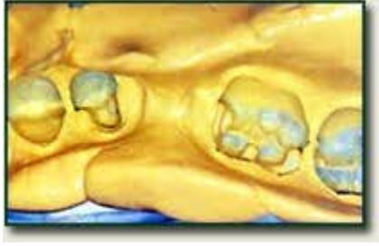
Figure 4. Final impression demonstrating excellent reproduction of margins and detail.

By using the Triple Tray, the need for a separate impression of the opposing arch and a bite registration record were eliminated. The quadrant impression was held up against a light source and examined for perforations in the occlusal surfaces. In many cases, when the patient bites down into MI, several small perforations indicating that these areas were in occlusion during the impression may occur (Figure 5).